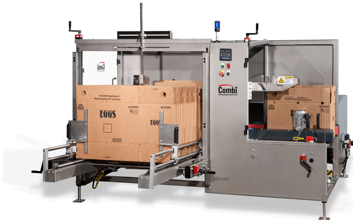
2-EZ ® XL with Powered Case Magazine