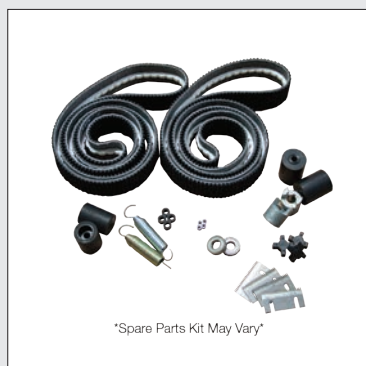
Spare Parts Kit