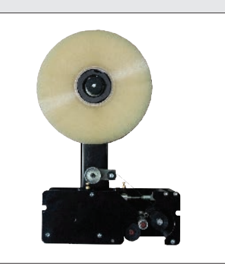
Spare Tape Head