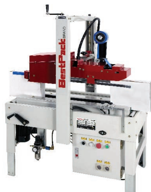
Interlock Safety Gates not shown but are included in the front sealing section.

The MS1E is available with a 2" Pneumatic High Speed BestPack Tape Head. All units are available in standard baked enamel finish and food grade 304 stainless steel for 21 CFR 110 compliance.