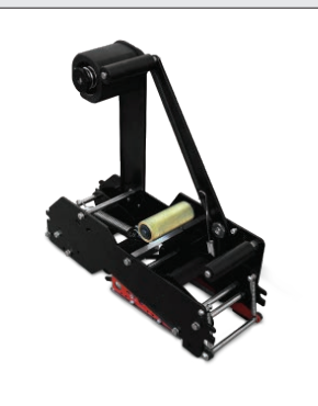
Spare Tape Head