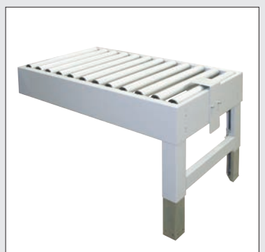
Long Infeed/Exit Conveyor w/ L-Bracket