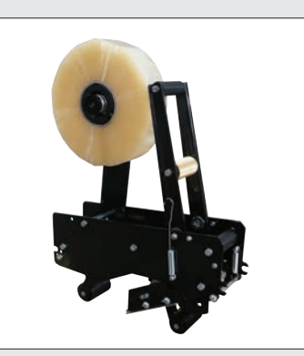
Spare Tape Head