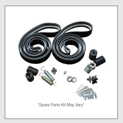
Spare Parts Kit