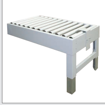
Long Infeed/Exit Conveyor w/ L-Bracket