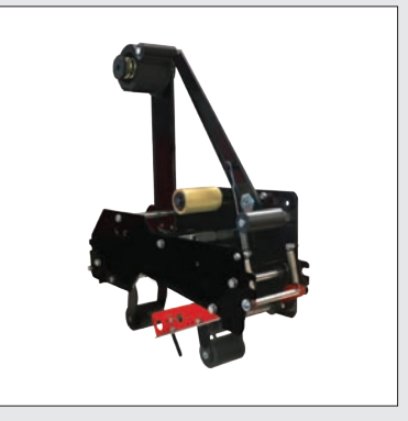
Spare Tape Head