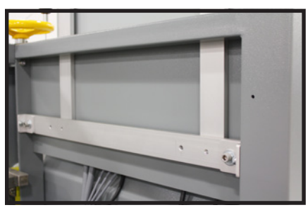
Developed and constructed with heavy duty components for long lasting performance