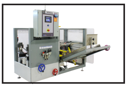
Compact design allows machine to fit in small operations