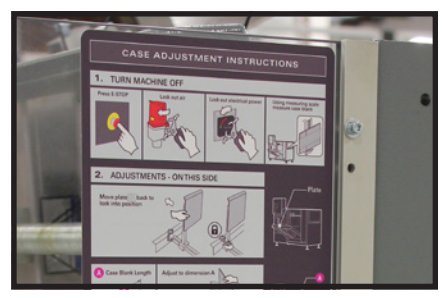
User friendly pictorial guides allow for easy training and operation