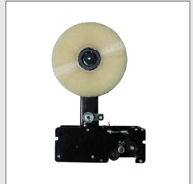
Spare Tape Head