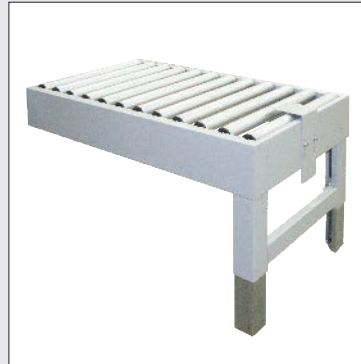
Long Infeed/Exit Conveyor w/ L-Bracket