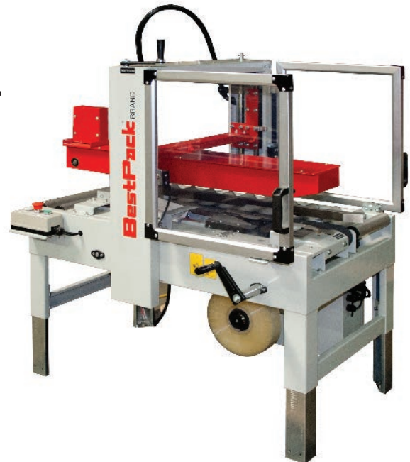
Unit shown: The MT1EBL, seals the bottom left edge.

The MT1E is available with a 2" Pneumatic High Speed BestPack Tape Head. All BestPack units are available in our standard baked enamel finish and food grade 304 stainless steel for 21 CFR 110 compliance.