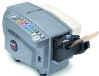
Better Pack ® 555e Series