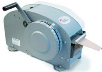
Better Pack ® 333 Plus

Just grip the BP E-Z Pull Tab ® , pull the E-Z open tear strip, and ZZZZZZZZip...It's Open!