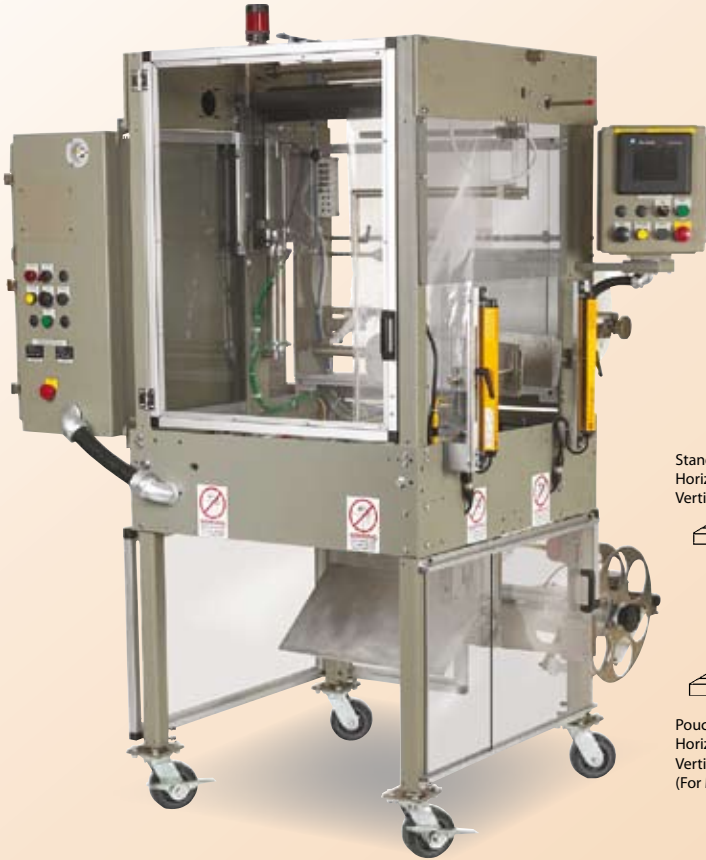
Standard Seal Assembly Horizontal Seal Above Vertical Seal