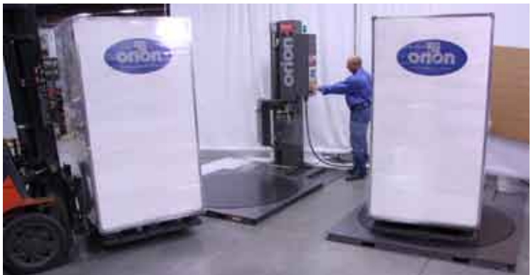
The carriage on the existing turntable easily reaches the second turntable.

Contact your local Orion distributor to discuss the best configuration for your application & for a CD of the Dual Turntable Kit in action.