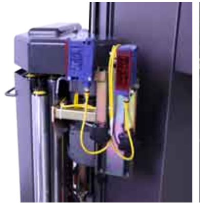
Kit includes second load height photo cell for additional turntable