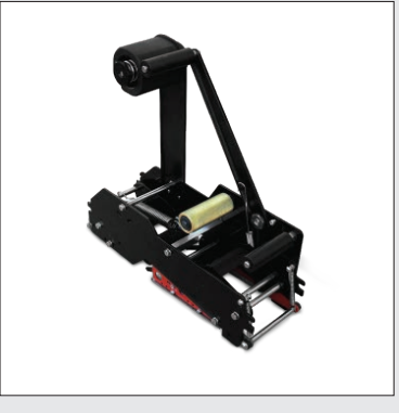
Spare Parts Kit